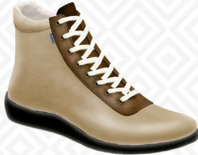
MANAMA ML 02