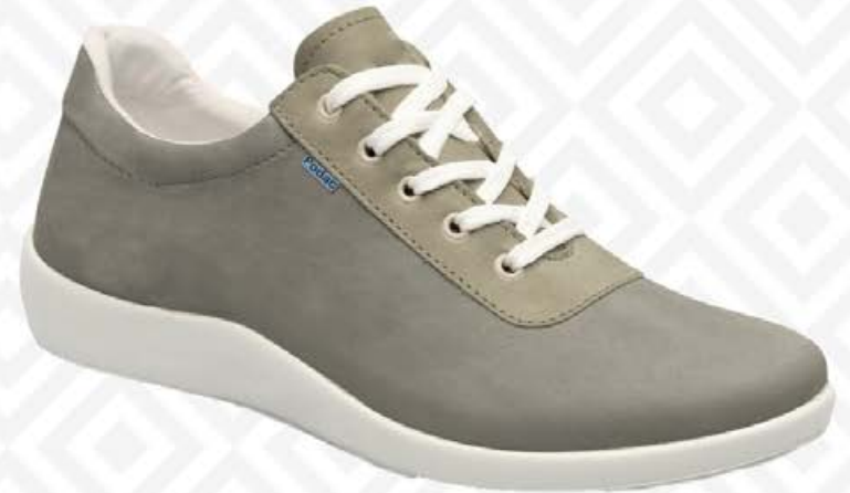
MANAMA BL 02