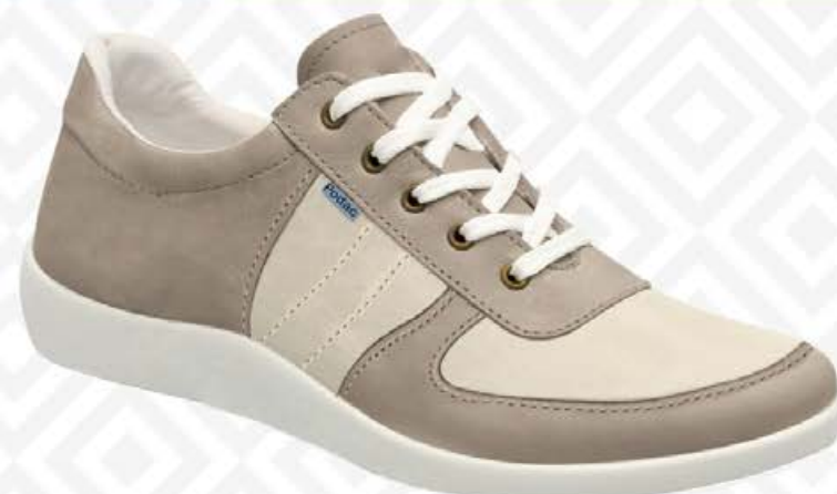
MOSCOU BL 02