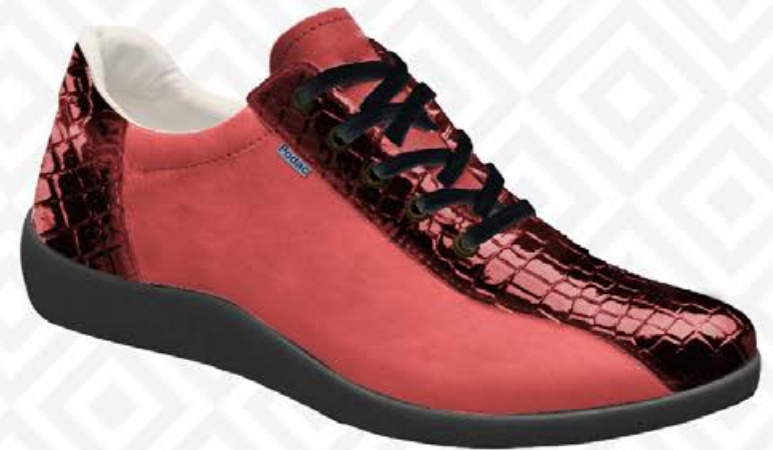
MALABO BL 02