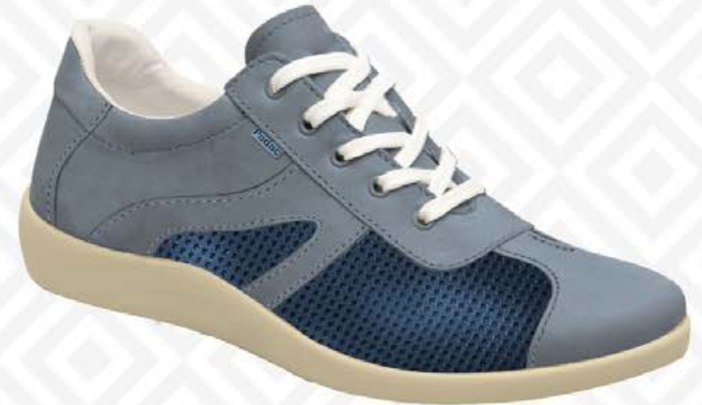
BISSAU BL 02