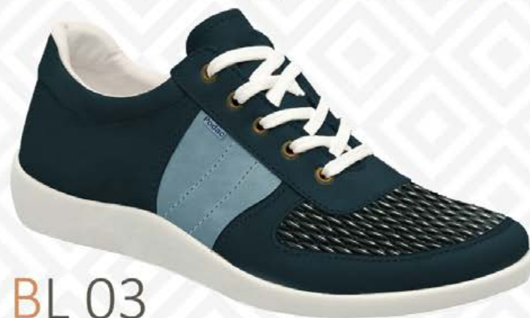
MOSCOU BL 03