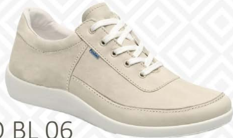
MONACO BL 06