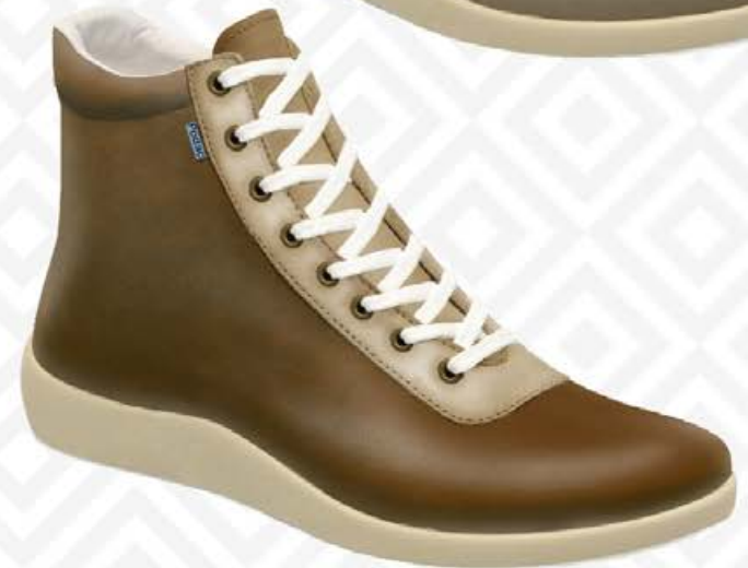
MANAMA ML 04