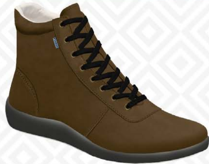
LUANDA ML 01