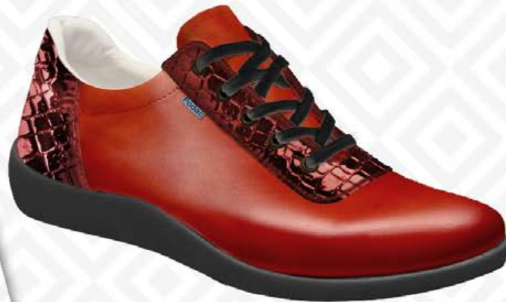
COTONOU BL 02