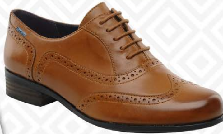
FUNAFUTI BL 01