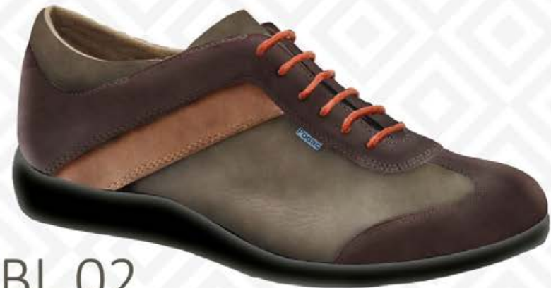
DACCAN BL 02