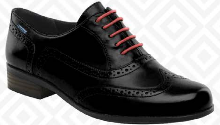
FUNAFUTI BL 02