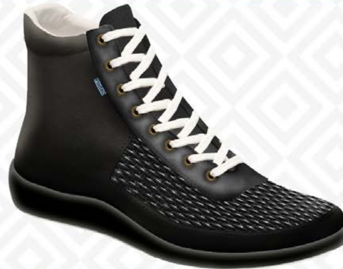
MONACO ML 02