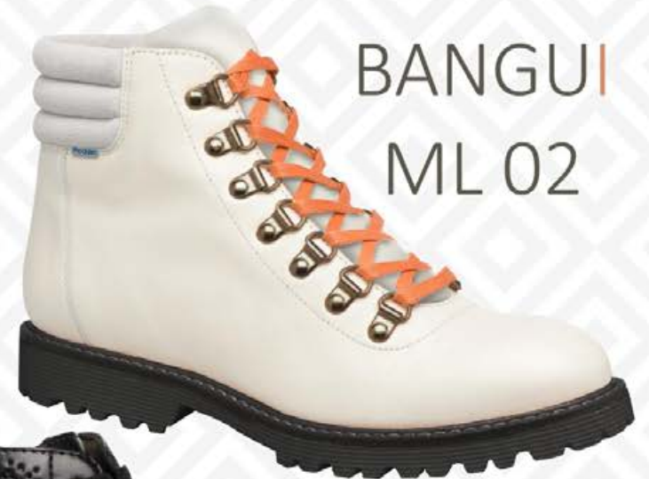
BANGUI ML 02