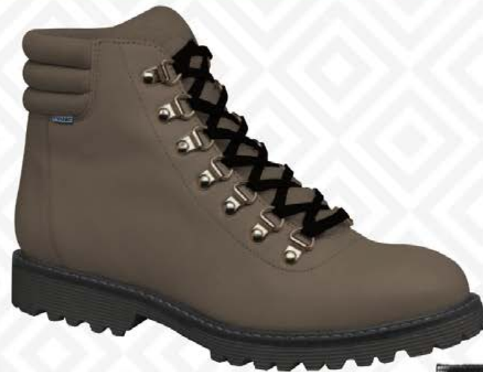
BANGUI ML 01