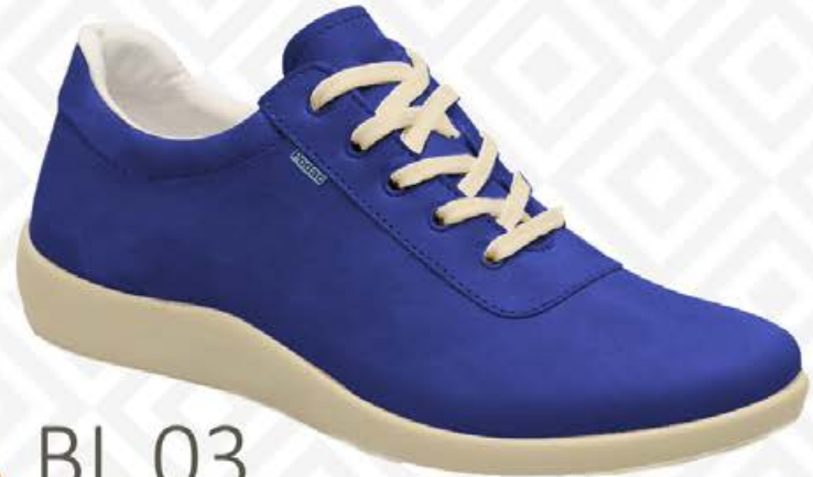
MANAMA BL 03