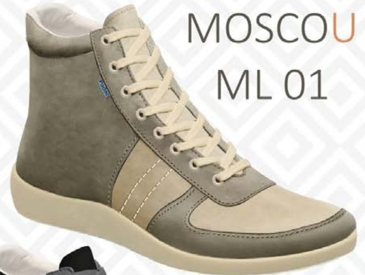
MOSCOU ML 01