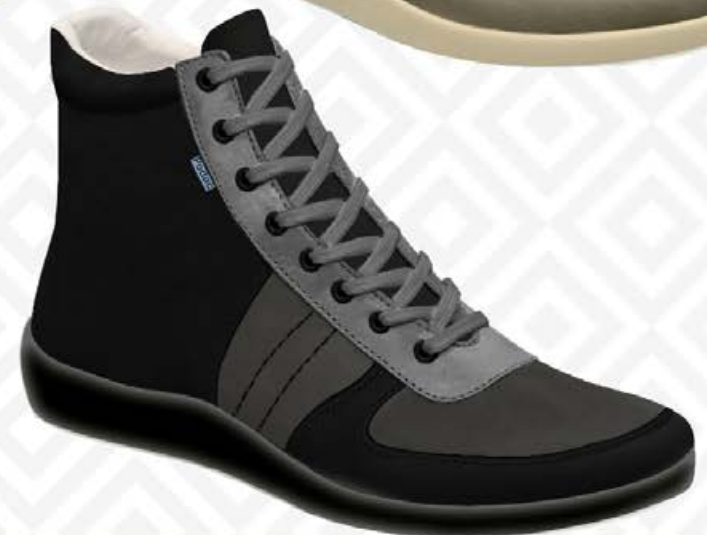
MOSCOU ML 02