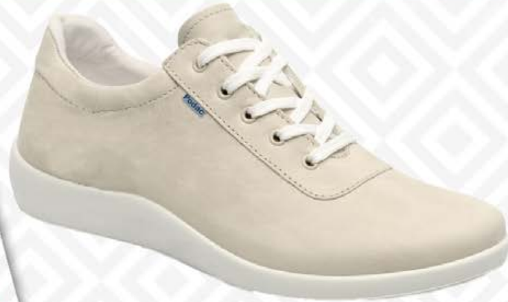
MANAMA BL 01