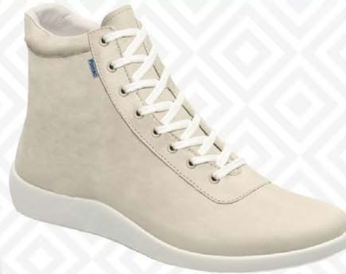
MANAMA ML 05