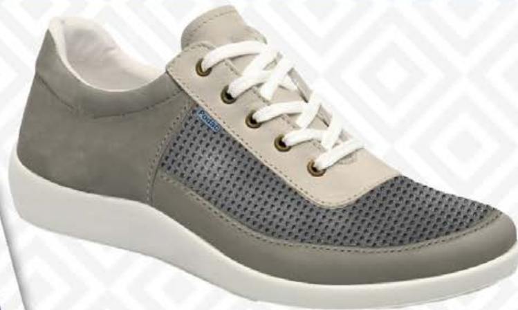
MONACO BL 04