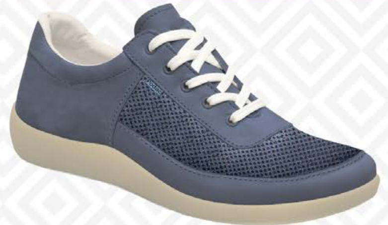
MONACO BL 05