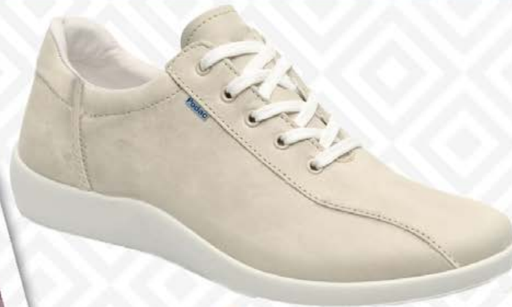
MALABO BL 01