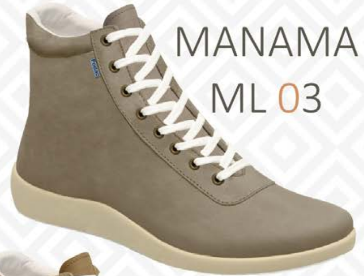
MANAMA ML 03