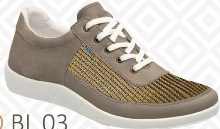
MONACO BL 03