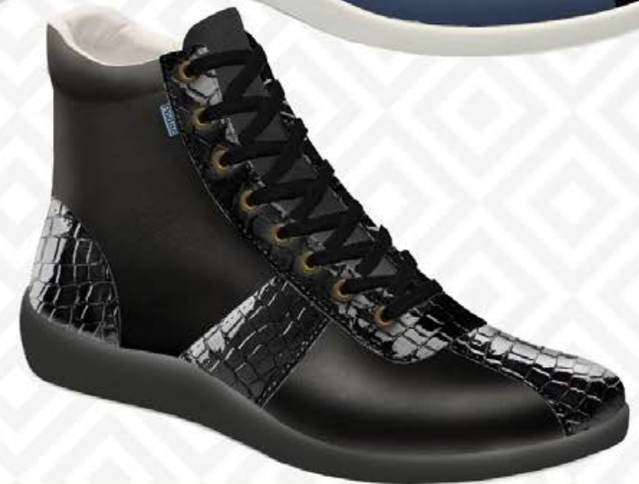
MORINI ML 02