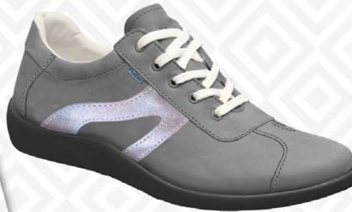
BISSAU BL 01