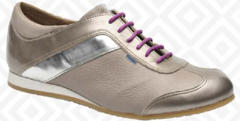
DACCAN BL 01