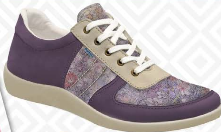
MOSCOU BL 01