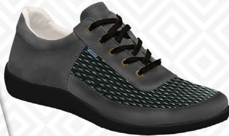
MONACO BL 01