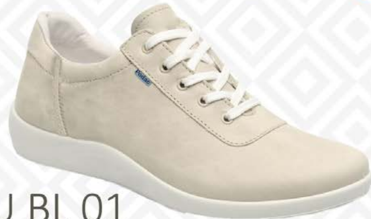
COTONOU BL 01