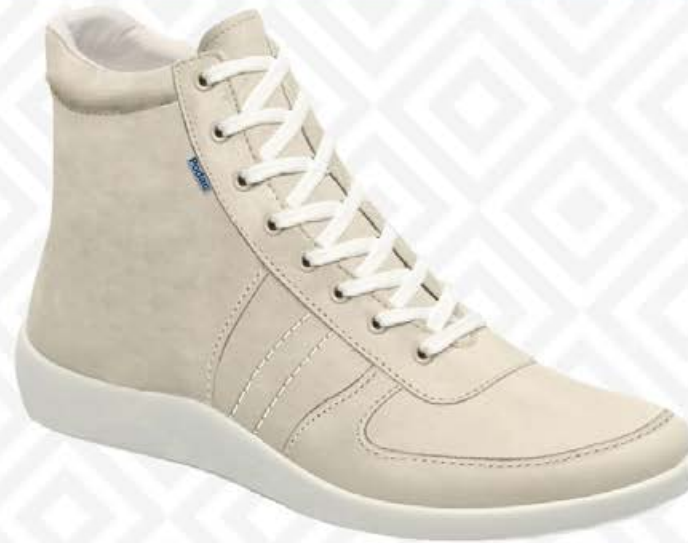
MOSCOU ML 03