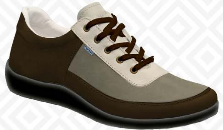
MONACO BL 02