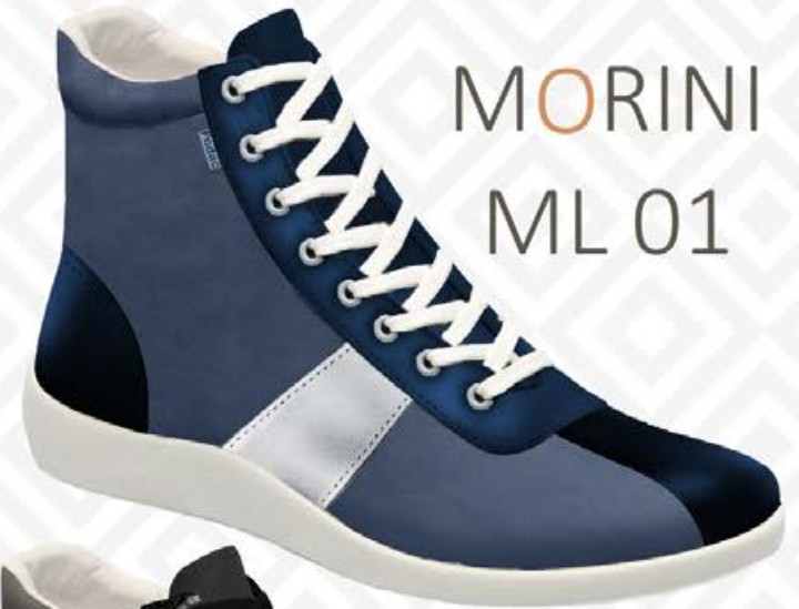
MORINI ML 01