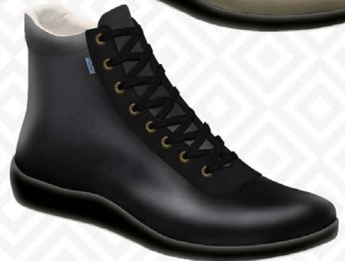
MANAMA ML 01