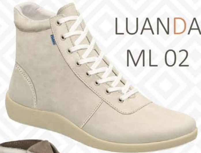
LUANDA ML 02