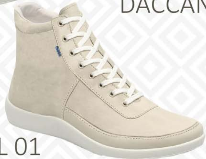
MONACO ML 01